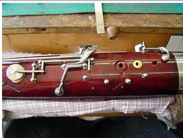
Remove the keys