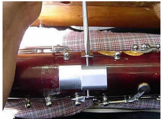
Screw in the screws a little bit and check everything to be OK. Then turn the screws changing sides so the strip is equally tighten.