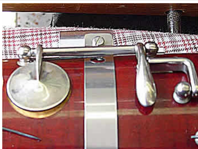
Also the springs.