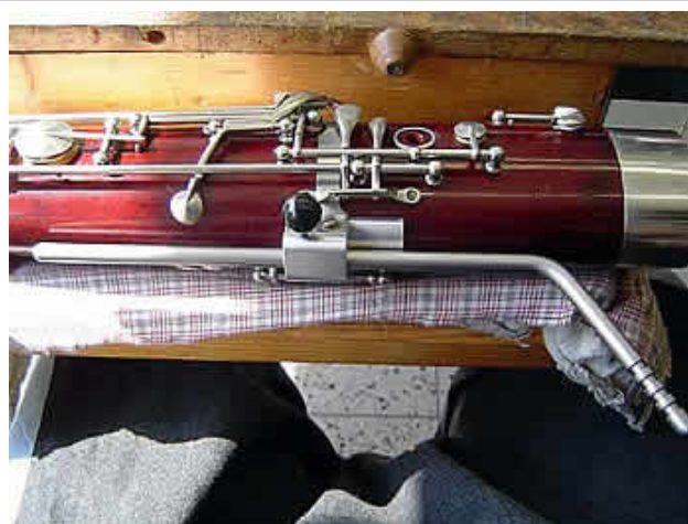
The bassoon is ready.