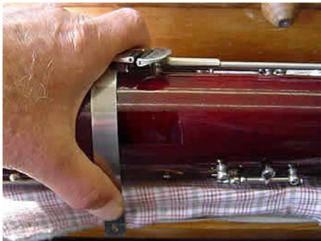
Start with the strip on the back at the market place. Bend both sides of the strip to the block on the other side. Don't twist the strip.