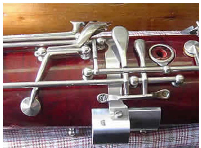
All keys have enough space.