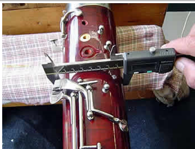
Take the exact measurements on the small side and the wide side