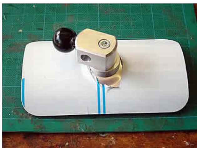
Take the top protection of the plate.