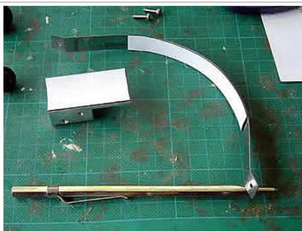
Bend the ends so they can fit straight against the block. Paste the double-sided tape on the strip and the block (keep one side covered).