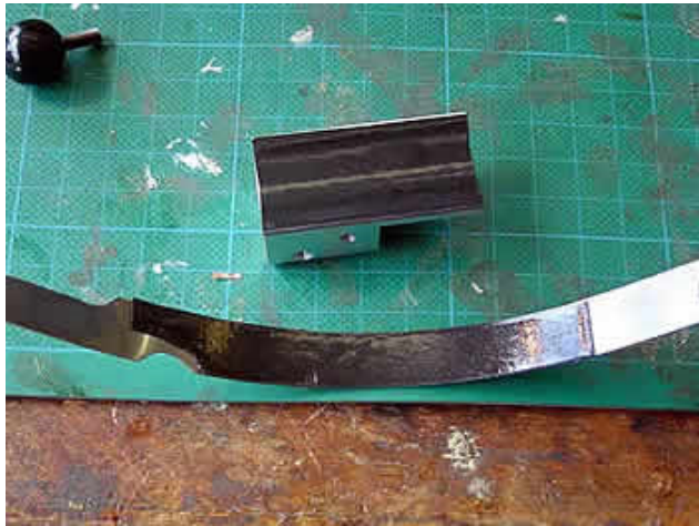
Demount and remove the protection of the tape. This tape is very sticky so be sure the strips fits. (The tape is sticky but doesn't damage the varnish)