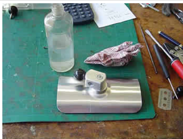
When needed clean with white spirit.