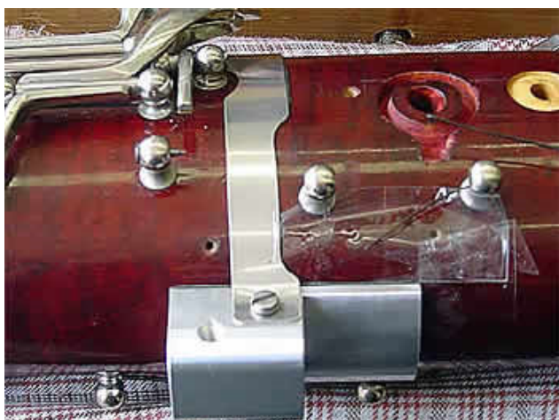
The strip is proper fixed and tight. You can mount the keys now.