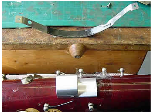
Put the block in place.