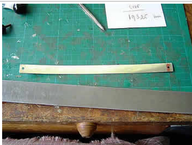
Make the end a little round and smooth out all sides of the strip.

The result is the distance between centres. Take on both sides 5 mm extra and make the strip at length. Drill the two holes 3,1 mm.